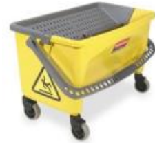
Rectangular Mop Bucket