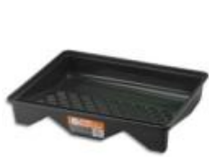
21" paint tray