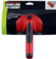
Applicator Trim Pad