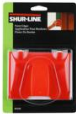
Applicator Trim Pad